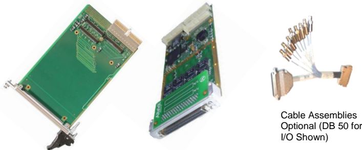
Cable Assemblies Optional (DB 50 for I/O Shown)

Alta Data Technologies' cPCI-1553 interface modules (PMC on 3U or 6U Carriers) are multi-channel (1-4) 1553 cards supported by the latest software technologies. These cPCI cards are based on the industry's most advanced 32-bit 1553 FPGA protocol engine, AltaCore™ , and by a feature-rich application programming interface, AltaAPI™ , which is a multi-layer ANSI C and Windows .NET (MSVS 2005/08/10 C++, C#, VB .NET) architecture. This hardware and software package provides increased system performance and reduces integration time.