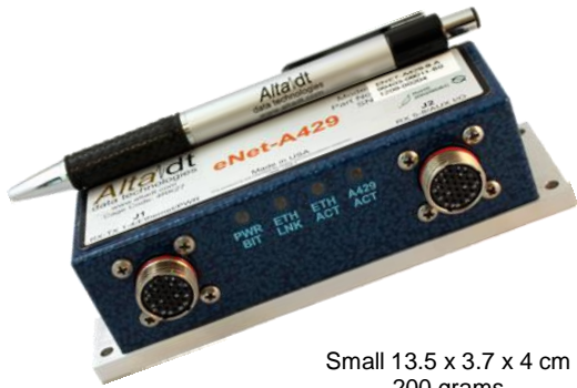
Small 13.5 x 3.7 x 4 cm 200 grams