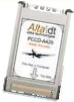
Rugged, Thumb-Screw Connector to Flying Cable Included