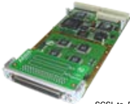
SCSI to Flying Lead Cable Provided