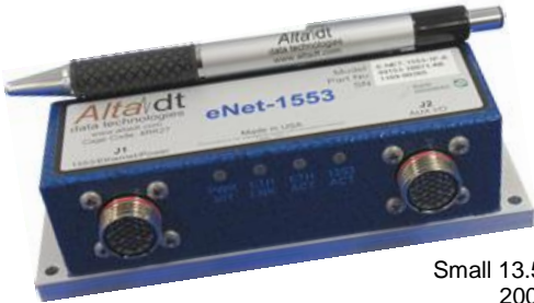
Small 13.5 x 3.7 x 4 cm 200 grams Rugged MIL 810G Tested