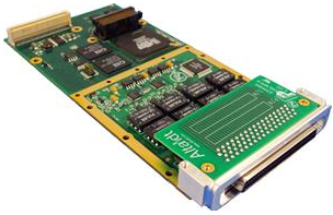
SCSI to Flying Lead Cable Provided