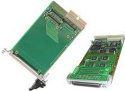
SCSI-Flying Lead Cable Provided