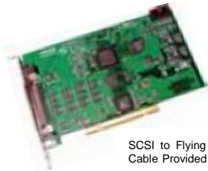
SCSI to Flying Lead Cable Provided