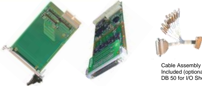
Cable Assembly Included (optional DB 50 for I/O Shown)

Alta Data Technologies' cPCI-1553 interface modules (PMC on 3U or 6U Carriers) are multi-channel (1-4) 1553 cards supported by the latest software technologies. These cPCI cards are based on the industry's most advanced 32-bit 1553 FPGA protocol engine, AltaCore™ , and by a feature-rich application programming interface, AltaAPI™ , which is a multi-layer ANSI C and Windows .NET (MSVS 2005/08/10 C++, C#, VB .NET) architecture. This hardware and software package provides increased system performance and reduces integration time.